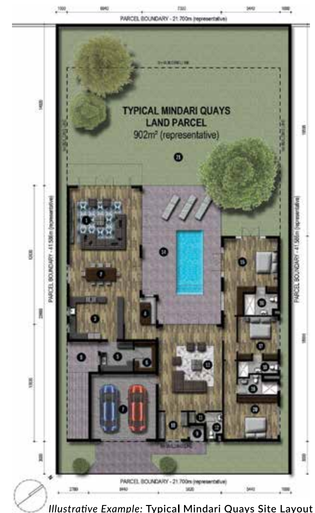
Illustrative Example: Typical Mindari Quays Site Layout incl. -330m 2 3 Bedroom Single Storey House -90m 2 Outdoor Entertainment Area -340m 2 Garden